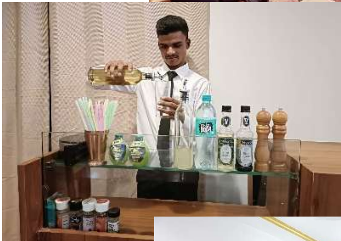
Wine, Bar & Beverage Service