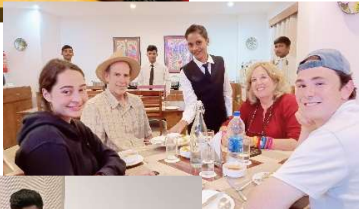
Food and Beverage Service Techniques